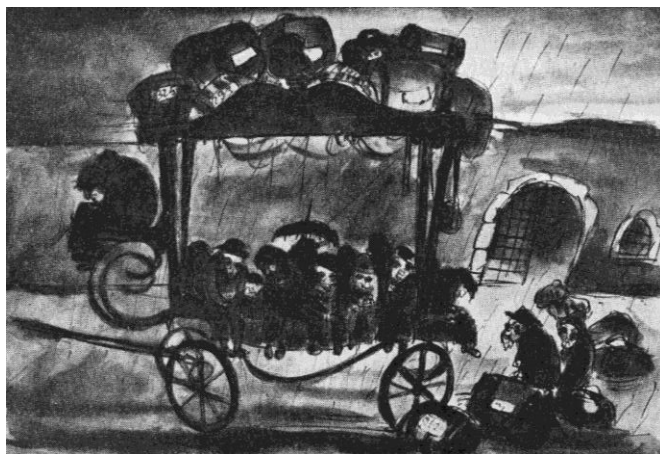
6- Deportation with a hearse, unsigned, fall of 1942 Aged people sorted out for deportation via „Old-Age-Transport“ are removed with an old hearse, the only means of transportation for internal use in the camp.