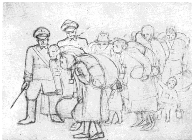
5- Infront of Eichmann's adjunct HSTF Moehrs (right) and camp commander OSTF Rahm those people selected for transport to Auschwitz by train pass Bahnhofstraße L2. A card board label around their neck shows their transport number.